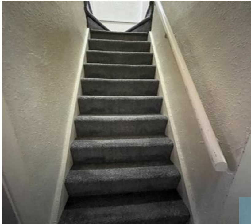
Category - falls on stairs

The stairs have been adapted and the bottom three steps which wound in to the room have been removed and this new staircase made. These stairs have been condemned by Building control and action is being taken by the Team