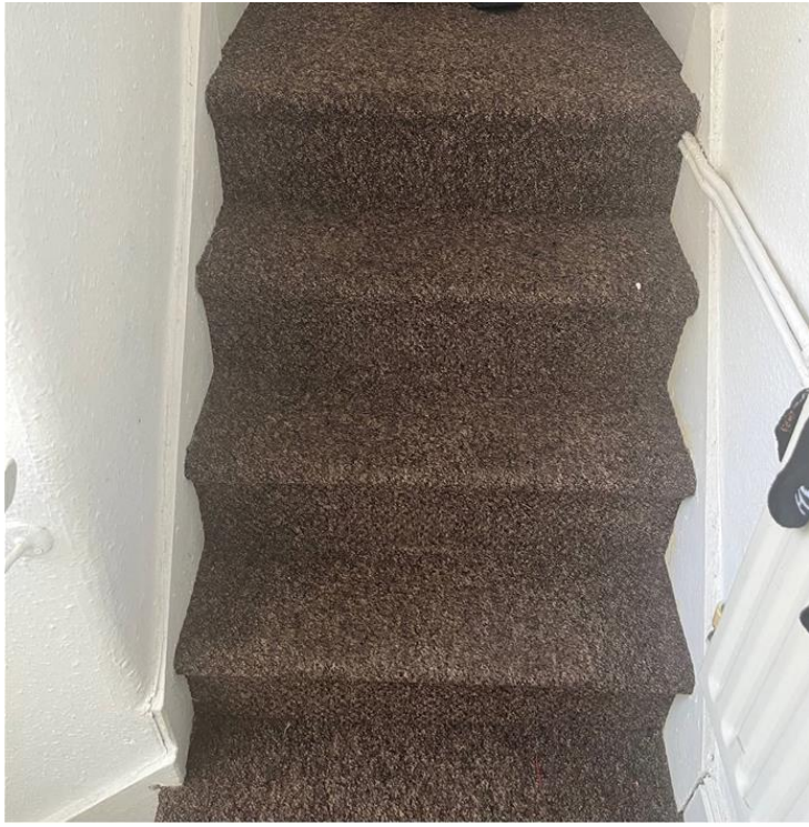
Category - falls on stairs - No Handrail

Category - Structural Collapse and falling elements